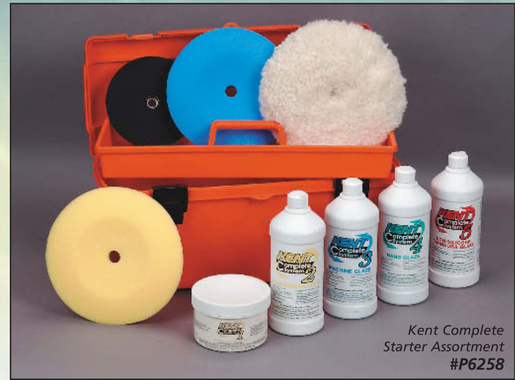
Kent Complete Starter Assortment #P6258

Large #P5707 tool box included at no charge