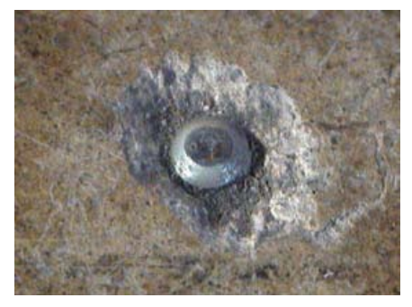
Damaged floor with remains of traditional anchor