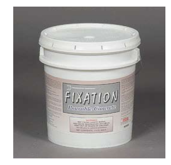
Fixation concrete patch