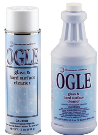
Available in aerosol or liquid quart bottle