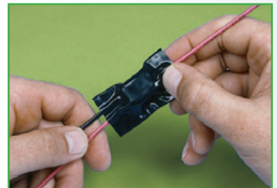
Wrap and seal