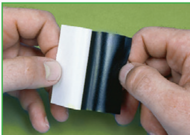
Peel off backing