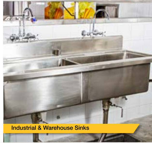
Industrial & Warehouse Sinks