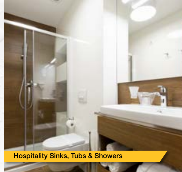
Hospitality Sinks, Tubs & Showers