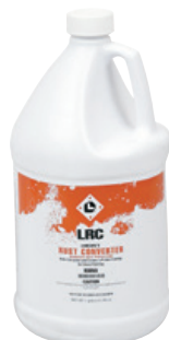
93002 (1 Qt.) 93855 (1 Gal.)