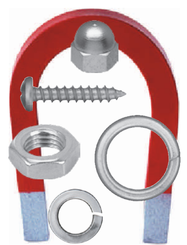
Assorted stainless steel fasteners with small diameters or thin profiles which can easily be picked up by a magnet.