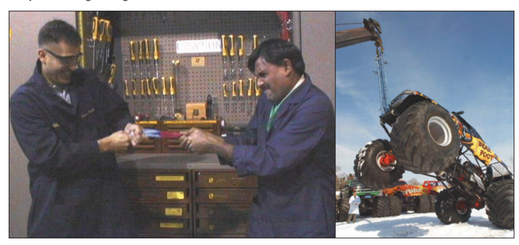
Super Absorbent! Compare the WypAll® X to other common wipers and rags.

In a tug-of-war, WypAll® X stands up to shop towels and rags, even when wet. They are strong enough to lift a 10,000 lb. monster truck.