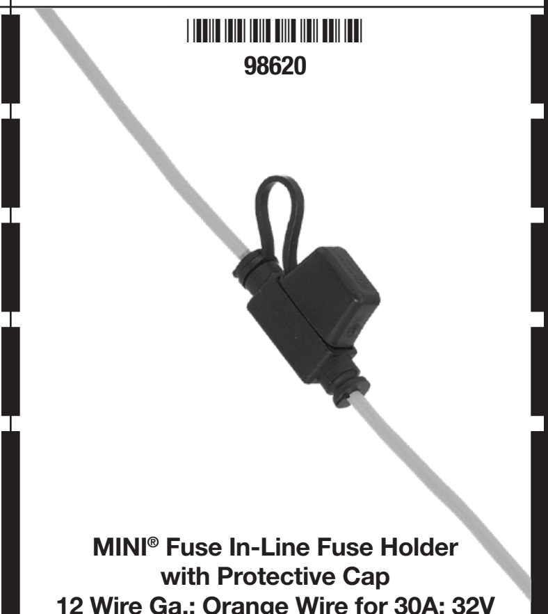
MINI® Fuse In-Line Fuse Holder with Protective Cap 12 Wire Ga.; Orange Wire for 30A; 32V