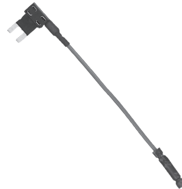
MINI® Add-A-Circuit for use with MINI® fuses up to 10A