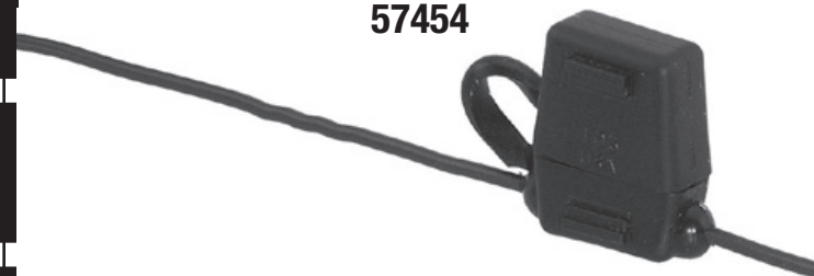
ATO® Fuse In-Line Fuse Holder with Protective Cap 16 Wire Ga.; Black Wire for 1A – 20A