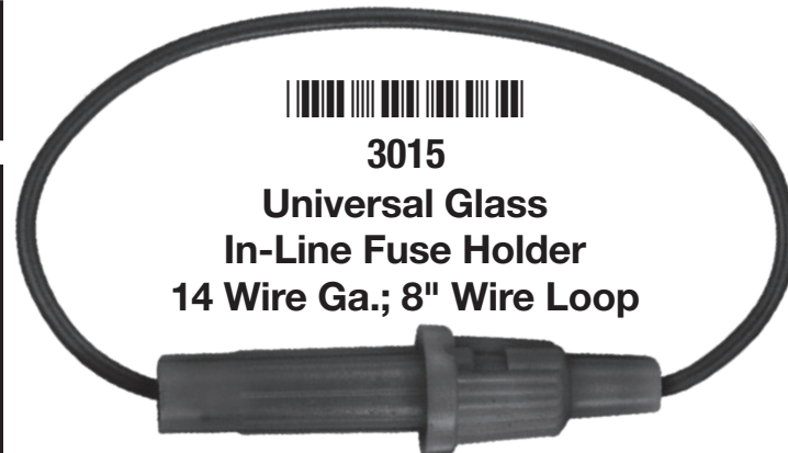
Universal Glass In-Line Fuse Holder 14 Wire Ga.; 8" Wire Loop