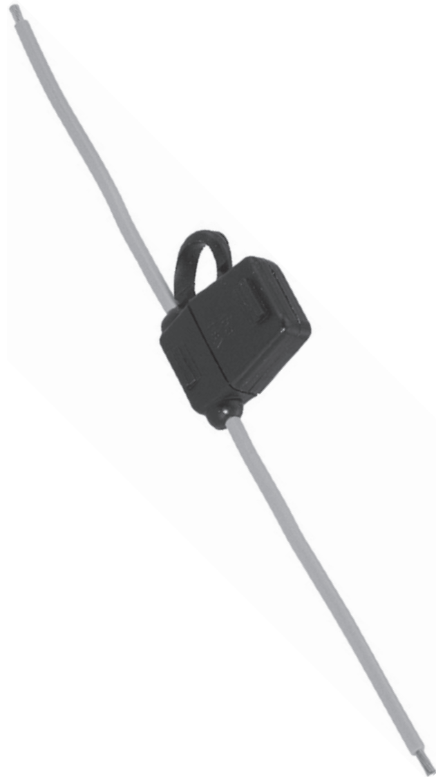
ATO® Fuse In-Line Fuse Holder with Protective Cap 12 Wire Ga.; Orange Wire for 25A – 35A