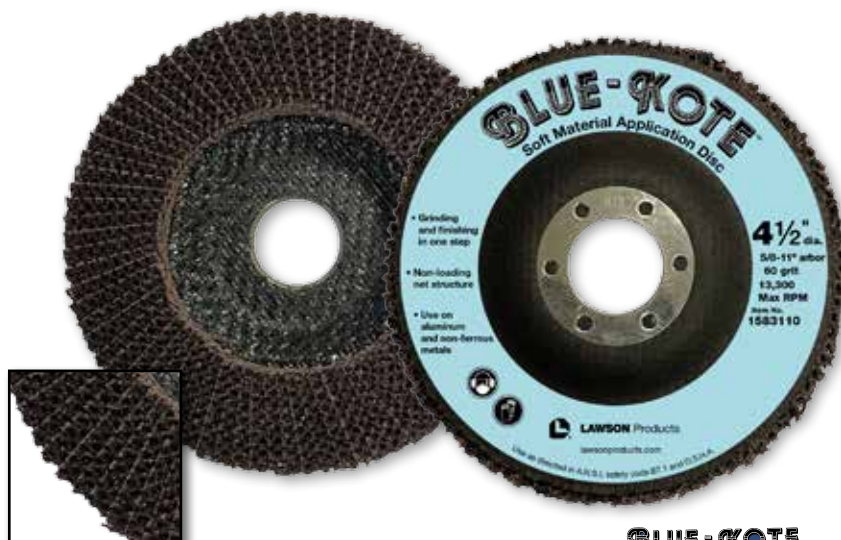
Net Structure Flaps