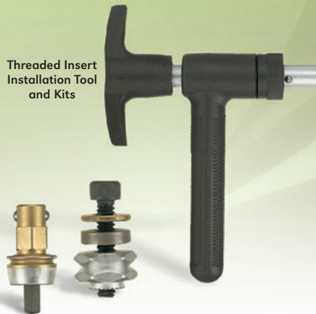
Threaded Insert Installation Tool and Kits