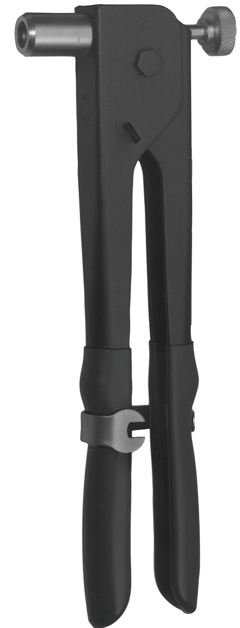
Diamond Grip II and Thin Wall Insert Installation Tool (Not Actual Size)